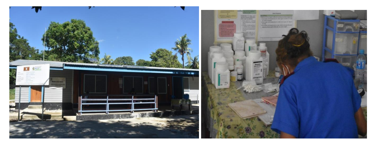
Fig. 5. Above Marara Area Health Clinic (front view) Nurse on duty

Guadalcanal health services facilities are distributed by zones in which each health zones are managed by the Area health center and so, therefore, as per the below-described table summarises health clinics by area.