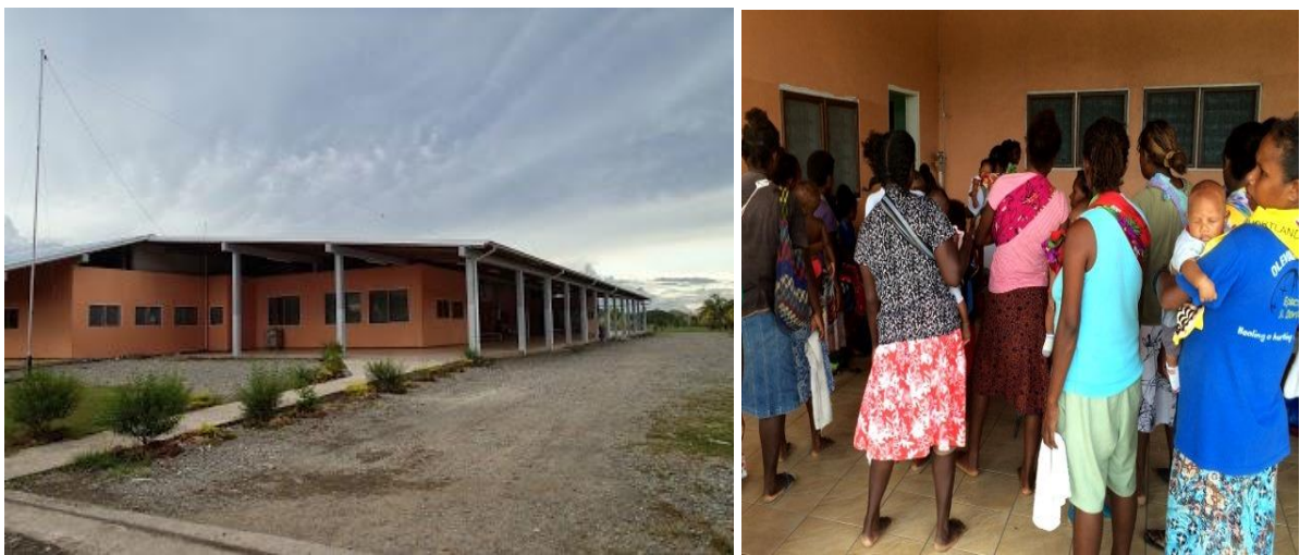
Good Samaritan Hospital front view and patients waiting for medical attention